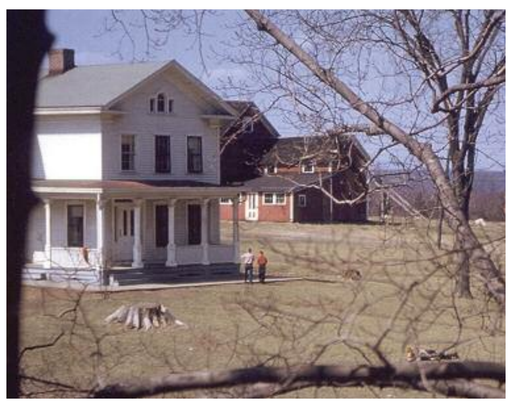
Some of the original buildings at Boys Village, c. 1940s.

1942) by pointing out that his facility would be "...neither a penal institution nor a reform school. The fair-minded citizens of Milford, where I have been a resident and voter for nearly a quarter of a century, I believe, have confidence enough in me and know me well enough to know that I would not bring anything to Milford that would not be an asset to that beautiful town."