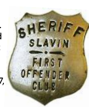
Children who joined the First Offender Club received a nickel-plated badge.

(c) 2016 CONNECTICUT EXPLORED. Vol.14 No.4, Fall, 2016. www.ctexplored.org Copying and distribution of this article is not permitted without permission of the publisher.